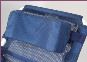
Delta Head Rest