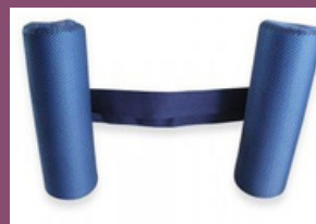
Side Support Rolls

View our full range of accessories on our website: www.orchid-medicare.co.uk